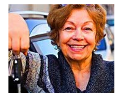
Texas Drivers (Born Before 1966) Hit with a Big Surprise