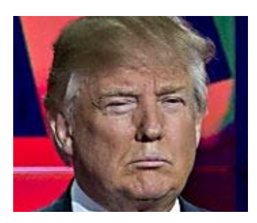
Keep Trump out of the White House

Paid for by Hillary Victory Fund - hillaryclinton.com/go