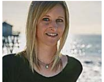
Been There: Watch Four Stories About Overcoming Ulcerative Colitis