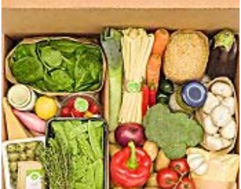
This Service in Austin is Changing the Way People Cook at Home