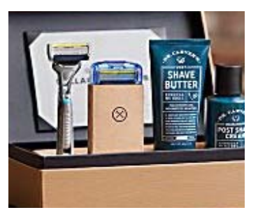
The One Father's Day Gift That Every Dad Wants (And Needs)